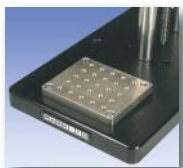
Base plate AC1060 Contains 25 #10-32 threaded holes for fixture mounting