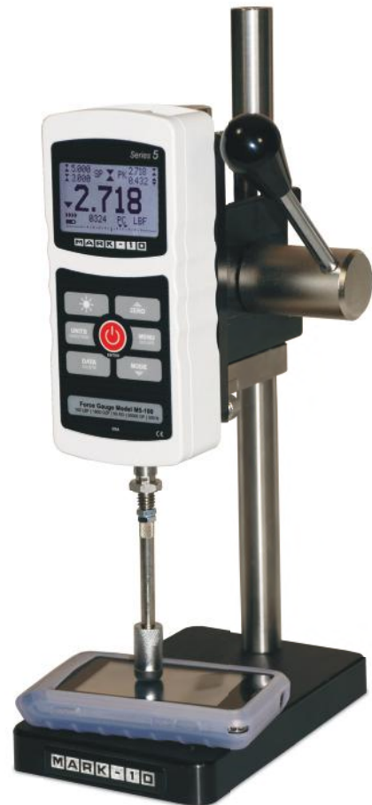
The ES05 is shown in a switch contact activation test, with Series 5 digital force gauge, extension rod and rubber tip attachment.