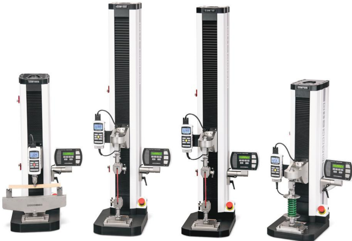
ESM1500S 1,500 lbf [6.7 kN] 14.2 in [360 mm] travel