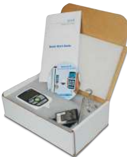
< Shown with the included cushioned shipping carton and optional accessories

The gauges are overload protected to 200% of capacity. An ergonomic, reversible aluminum housing allows for hand held use or fixture mounting, rugged enough for applications in both production and laboratory environments. Series 2 gauges are directly compatible with Mark-10 test stands and grips.