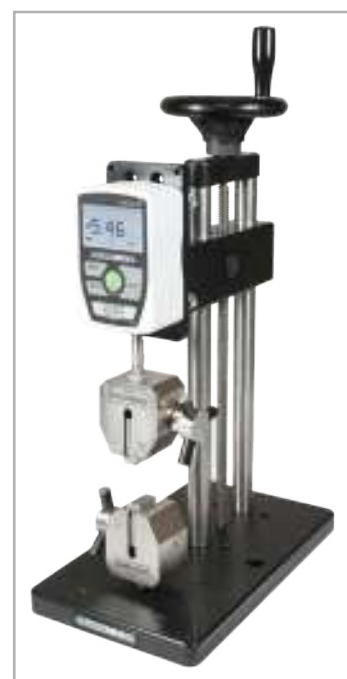
> Shown with an ES20 test stand with G1061 wedge grips