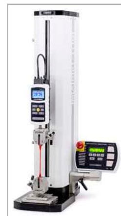
Shown with an ESM303 test stand and G1061 wedge grips

Series 7 force gauges are directly compatible with Mark-10 motorized test stands, to permit functions such as break testing, tensile testing, compression testing, dynamic load holding, PC control capability, and many other applications.