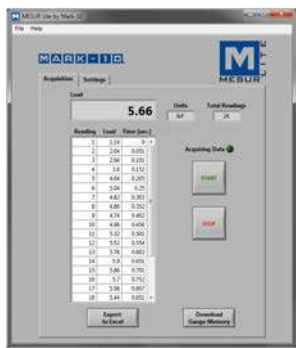
MESUR™ Lite data acquisition software is included with Series 7 gauges

Series 7 gauges include all the functions of Series 5 gauges, with several additional features, including high speed continuous data capture and storage, with memory for up to 5,000 readings at an acquisition rate of up to 14,000 Hz. The gauges also feature programmable footswitch sequencing, break detection, and 1st / 2nd peak detection. Series 7 includes a coefficient of friction unit of measurement and user-defined unit of measurement. For productivity enhancement, the gauges also feature automatic data output, data storage, and zero functions upon the completion of break detection, averaging, external trigger, and 1st / 2nd peak detection.