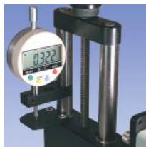
Digital travel indicator