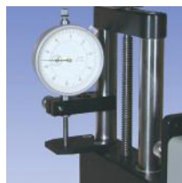
Dial travel indicator