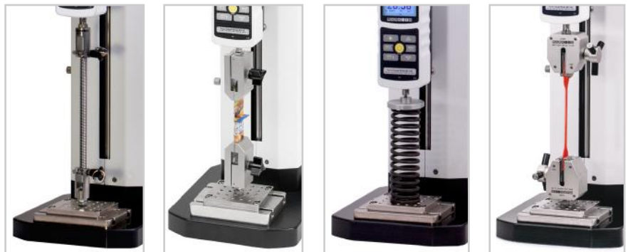
> Typical applications (l to r): extension spring testing, peel testing, compression spring testing, tensile testing