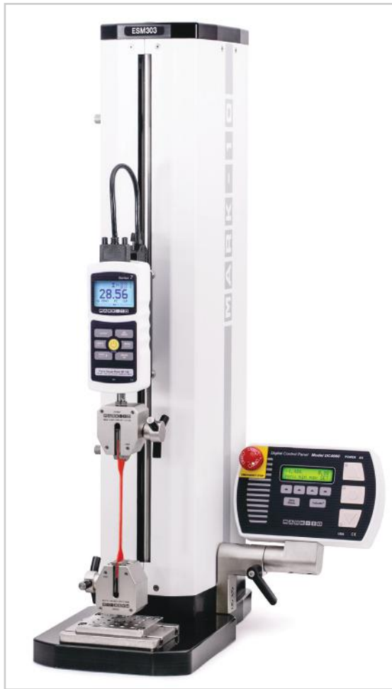
^ ESM303 is shown above configured for a tensile test, with a Series 7 force gauge and G1061-2 wedge grips.

The ESM303 is a highly configurable single-column force tester for tension and compression measurement applications up to 300 lbf [1.5 kN], with a rugged design suitable for laboratory and production environments. Sample setup and fine positioning are a breeze with available FollowMe™ force-based positioning - using your hand as your guide, push and pull on the force gauge or load cell to move the crosshead at a variable rate of speed.