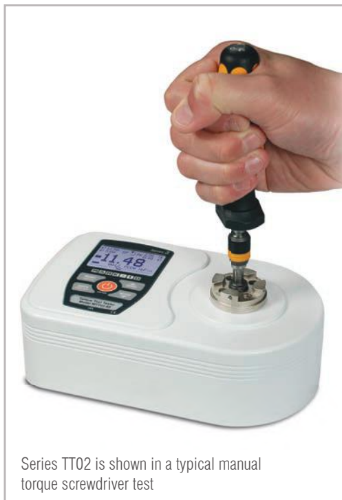
Series TT02 is shown in a typical manual torque screwdriver test

Series TT02 Torque Tool Testers present a simple and accurate solution for testing manual, electric, and pneumatic torque screwdrivers, wrenches, and other tools. These testers are compact and rugged, suitable for production environments. A universal 3/8" square receptacle accepts common bits and attachments. The TT02 captures peak torque in both measurement directions, and also calculates 1st and 2nd peaks, useful for click-type tools.