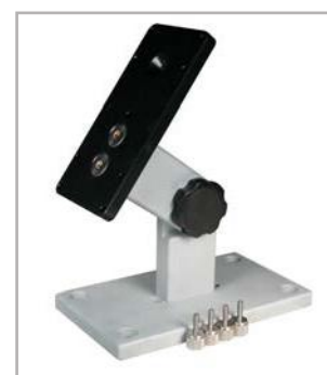
^ Optional AC1008 tabletop mounting stand