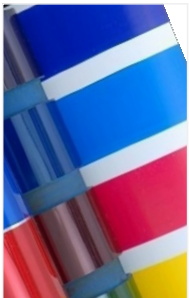
Ink & *Printing

It is widely used in ink, printing, film processing, textile dyeing, plastic electronics and other industries for accurate color measurement and quality control, as well as in scientific research institutions, quality testing institutions, laboratories; especially suitable for precise measurement and quality control of optical density and dot enlargement in ink printing.